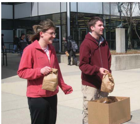
Students distribute Lent lunches on campus