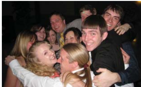
2009 STArry Night Spring Formal dance