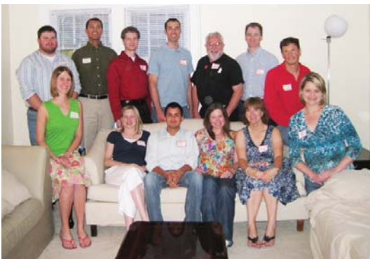
Kansas City area Alumni Dinner held June 11 at Meyer House in South Kansas City