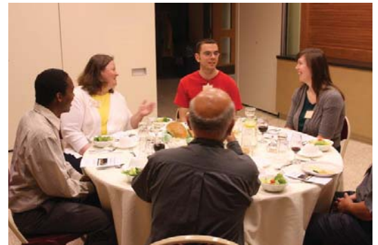
Spring and summer 2009 STA graduates enjoy a meal and share STA memories at the annual "Last Supper for Graduates" on April 25.