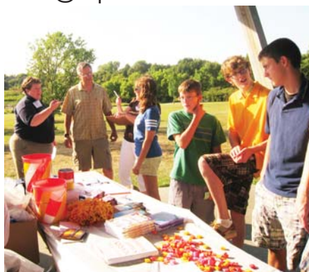
Current and new students register for door prizes