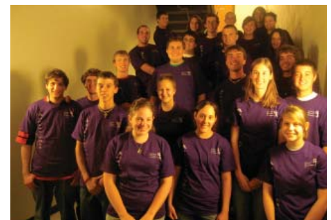
The STA Ambassadors Program is an extension of the Outreach team. They promote the STA Catholic student community's activities and programs within residence halls and Greek houses.